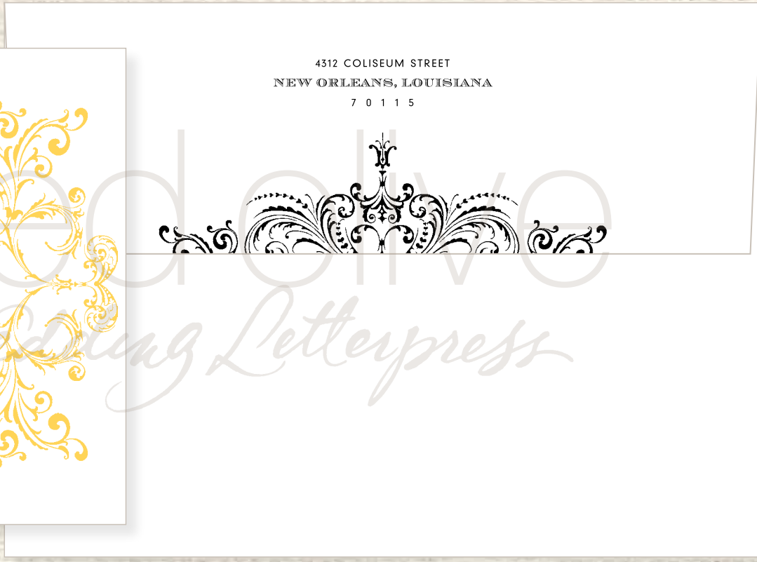
Save the Date Envelope