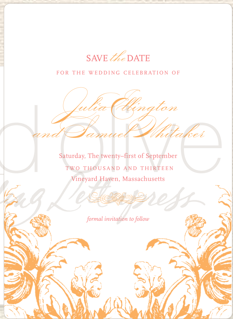
Save the Date