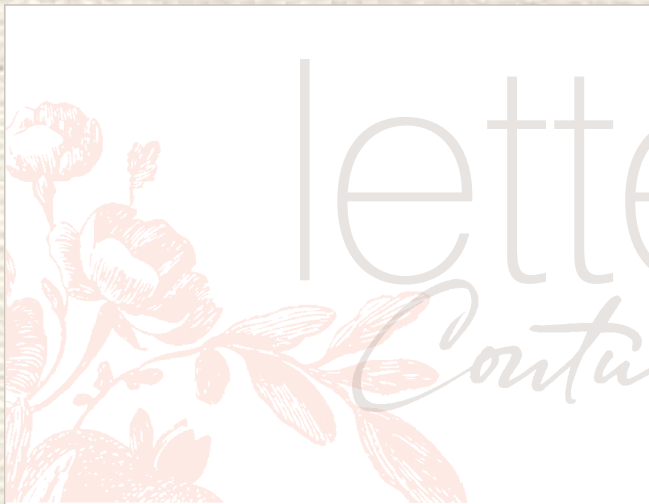
Folded Butler Card