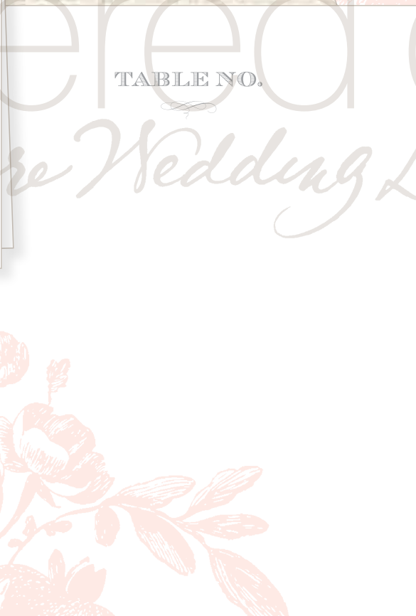
Folded Table Number