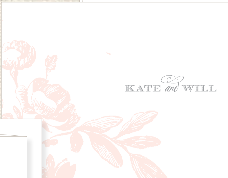
Folded Notecard & Envelope